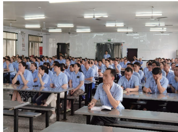
Trainings for chemical staff