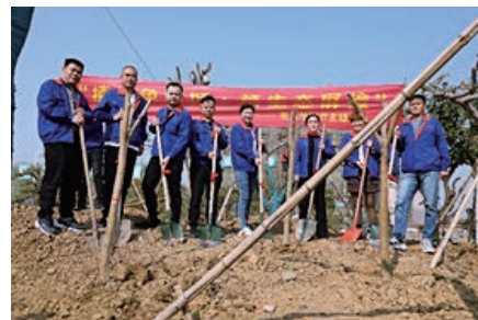
Arranging staff to organising themed activity on Arbor Day