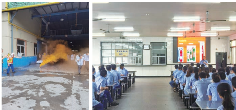
Yadong (Changzhou) conducting fire emergency drills

The Group has organised and carried out various safety education and training activities, including drills for comprehensive emergency plan, handling manual for fire at workshop, electric shock accidents, and mechanical injury. Through a series of drill events, the Group has effectively increased the employees' capability to cope with emergencies and improved their overall safety awareness. During the Reporting Period, Yadong (Changzhou) invested approximately RMB190 million in occupational health and safety. Total number of attendees for relevant training activities was 482 for the year, and the average training time of each employee was 12 hours. The total training hours on health and safety was 5,784 hours.