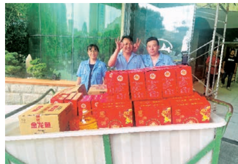
Mid-Autumn Festival welfare