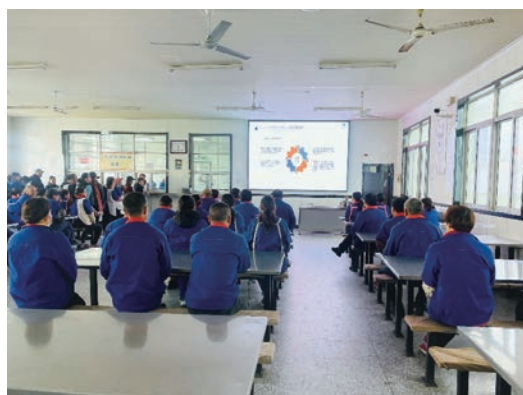
Safety training for employees