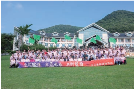
Organising outdoor development training