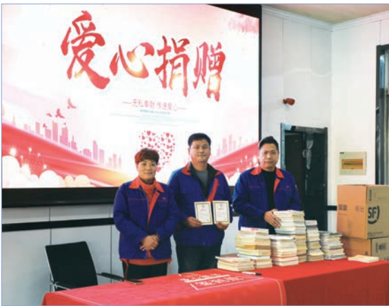
Yadong (Changzhou) organised a book donation event

In order to enhance the sense of social responsibility among our staff, we have been calling more and more staff to take part in volunteer activities. In concern of children's education and growth, the Group organised a book donation activity with staff. Under the assistance of China Post to deliver books, we donated books valued at over RMB3,000 to children living in rural mountains in poverty, providing them mental supports to enrich their life. At the same time, we provided convenient services for mountain residents, such as helping to renew driver's licenses, paying water, electricity and gas bills, and paying pensions in respect.