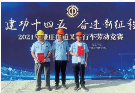
Forklift skill competition