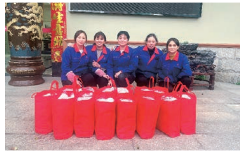
Women's Day Welfare