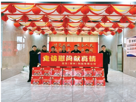
Visiting public security

The types of external donations made by the Group include charitable donations, relief donations and other donations. Charitable donations include those on education, science, culture, health and medical care, sports, environmental protection and construction of social and public utilities; relief donations includes relief donations and life relief to those affected by natural disasters and socially disadvantaged groups; and other donations includes donations in addition to the abovementioned, made for other social and public welfare and utilities for the purpose of promoting humanitarianism or to promote social development and progress. During the same period, Yadong (Changzhou) visited and expressed sympathy to public security and fire and rescue squad. During the Reporting Period, supplies valued at over RMB10,000 was donated to children and the elderly living in poverty regions.