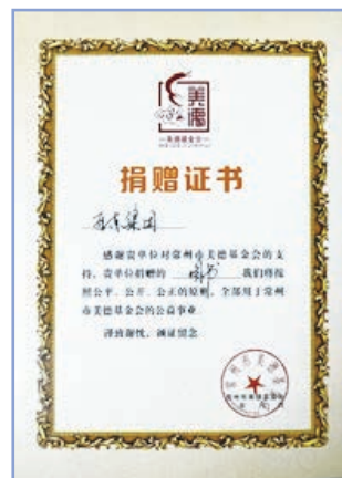
Granted certificate from Virtues Foundation (美德基金會)