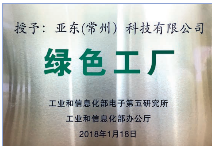
National Green Factory Label of Yadong (Changzhou)