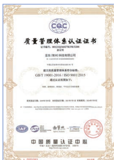
Certificate of Quality Management System Certification of Yadong (Changzhou)

The Group firmly believes that greige fabric in good quality is a pre-requisite for the product quality of the dyeing factory, and therefore achieves high manufacturing standards of products by enhancing inspection on greige fabric delivery. Yadong (Changzhou) requires its staff to follow directions on “Regulation, Standard, Openness, Transparency (規範、標準、公開、透明)” at work, and has internally established a Quality Management System (《質量管理制度》), which sets up a strict quality control procedures in all aspects, from the procurement of raw materials, production procedures, production process, finished products and packaging, and have obtained quality management system certification of GB/T 19001-2016 and ISO 9001:2015.