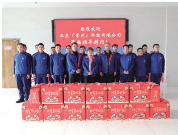
Visiting fire and rescue squad