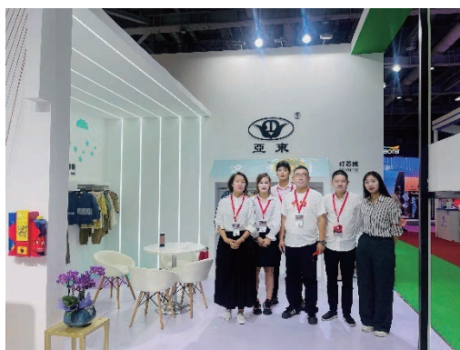
Intertextile Shanghai Apparel Fabrics Autumn (上海秋冬面料展會)

The Group attaches great importance to the research and development and innovation of products and technology. To develop product features and expand the business scope and field of products, Yadong (Changzhou) has made breakthroughs successively in development of multi-fibre blending fabrics (多纖維混紡面料). During the Reporting Period, under the keen competition of textile products, Yadong (Changzhou) managed to obtain 483 samples and 1,691 colour bits (1,691色色位), conducting test for 1,562 pieces of samples, reaching the Group's historical new height. During the Year, with its innovative products recognised by the market and the industry, Yadong (Changzhou) was invited to join the Intertextile Shanghai Apparel Fabrics Autumn (上海秋冬面料展會).