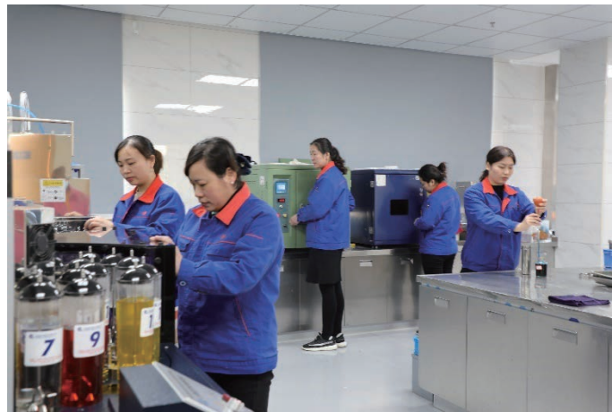
Daily work in testing laboratories

The Group's production process follows the principles of self-inspection for each machine, random inspection by the department and cooperation with the physicochemical laboratory, and the production process standards and inspection are strictly controlled. To facilitate control and adjustment of production process and in response to the target to high productivity and quality, in this report, Yadong (Changzhou) classified laboratory into two types as workshop physics and chemistry laboratory and testing centre laboratory, so as to allocate work focus in a more determined manner and ensure speed and quality of the operation. Workshop physics and chemistry laboratory mainly focuses on regular tests in workshop's production process, while testing centre laboratory focuses on testing for finished products. To facilitate control and adjustment of production process in workshops, tests in physics and chemistry laboratory puts emphasis on its speed; To ensure reliability of data and accuracy of report as well as to comply with certification from third-party certification organisation, testing centre laboratory puts emphasis on standards and regulations.