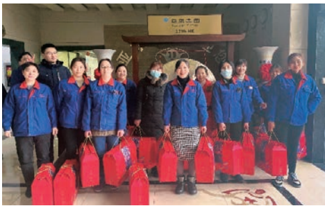
Distributing New Year gift bags to employees