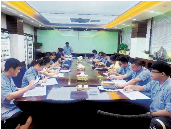
Internal trainings for staff

To further enhance its production efficiency and product quality in the future, Yadong (Changzhou) will strengthen trainings for technical positions and operational staff to enhance their testing skills, add testing equipment and items to stabilise testing skills as well as enhance accuracy of data to speed up process to get products qualified. At the same time, general management of staff from all departments is enhanced. trainings on techniques and relevant operational know-how are conducted each season. On-site management is enhanced to reduce human errors, keep the site clean and standardised so as to improve the overall comprehensive level.