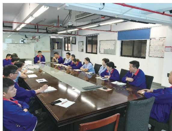
Vocational training organised by Yadong (Changzhou)