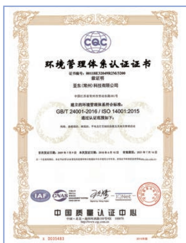
Environmental Management System Certification of Yadong (Changzhou)