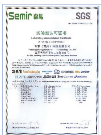
Approval certificate issued by Semir Laboratory (森馬實驗室)

During the period under review, Yadong (Changzhou) achieved outstanding performance in the tests on textile colour fastness against light, soap and water as well as slim slippage, and was awarded the certificate of approval by the laboratory of our partner garment manufacturer. In addition, Yadong (Changzhou) continued to conduct surveys on customer satisfaction during the Reporting Period to understand customer satisfaction level, opinions and suggestions in respect of four aspects: quality, price, delivery and service. 10 companies in total participated in the survey and the final satisfaction score was 97 out of 100.