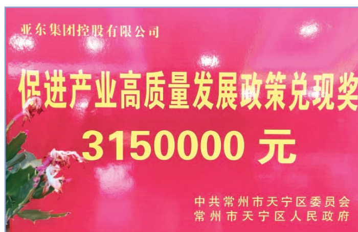
Award for realisation of policy for promoting quality development for the industry (促進產業高質量發展政策兌現獎) granted to the Company

Yadong (Changzhou) has formulated a sales return management system. Sales return shall be processed upon approval of sales head (銷售部長) and vice-general of sub-division (分管副總). When confirming the receipt of a return request from a customer, the personnel in-charge is required to complete a "Quality Handling Report". The quality inspection department conducts a quality inspection on the returned goods and will give its comments on the "Quality Handling Report". The warehouse keeper will re-count the quantity of returned goods and issue a "Return Repair Order" for finance department's registration. The finance department should handle the account accordingly after reviewing the "Quality Handling Report" and the return certificate issued by the returning party. After an analysis is performed on the reasons for the return, the responsibility of relevant department staff will be determined. During the Reporting Period, there was no recall of goods due to product quality and safety.