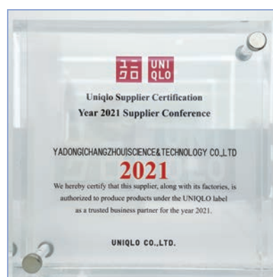
Qualified supplier certification from Uniqlo

The Group attaches great importance to the protection of consumer information and privacy. Yadong (Changzhou) clearly stipulates in the "Employee Management System (《員工管理制度》)" that employees must keep data provided by the Company and customers confidential. We strictly prohibit any employee from using or communicating confidential data to others, and require employees, supervisors and directors to sign confidentiality agreements when necessary to ensure they agree not to disclose confidential information.