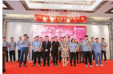
Organising speech competition